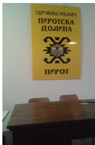
“Pirotska dolina”, Pirot, Serbia

Created in the 40s of the last century, the association “Pirotska dolina” has proved through the years as a reliable structure to gather beekeepers from the region of Pirot. Its members have decreased through the years, reaching the number of 140 in 2015, of which number 85 are members of the National Union of Beekeepers.