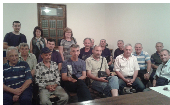
“Pirotska dolina”, Pirot, Serbia

beekeepers received up to 600 euros, in 2014 the amount was increased to 1000 euros, reaching 1500 euros in 2015.